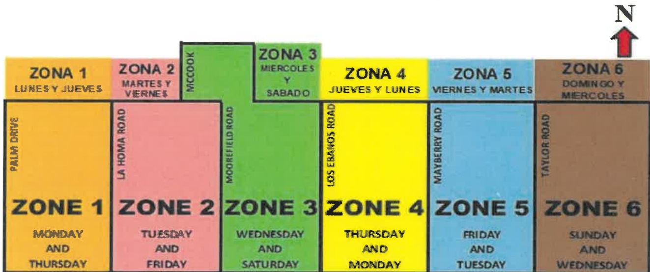
Exhibit B: Drought Contingency Conservation fee per Stage